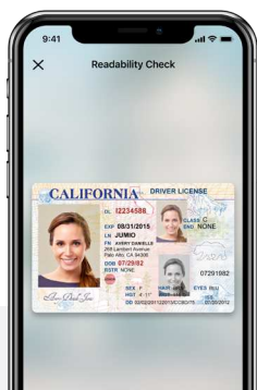
ID Verification Check

On the back end, Jumio leverages a highly secure and scalable AWS platform with gold-standard services including Amazon S3, Amazon DynamoDB, Redis, Amazon RDS, Elasticsearch and Amazon Cognito.